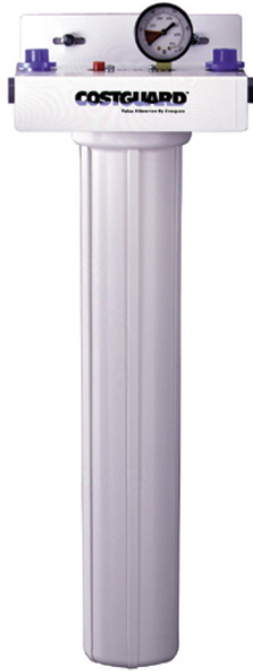
CGS-20 20" Single Housing: DEV9100-20