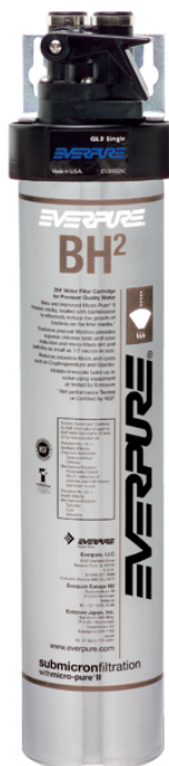
QL3-BH 2 System: EV9272-00

Delivers premium quality water for coffee applications