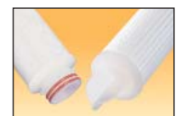
222 or 226 / Fin