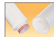
222 or 226 / Flat