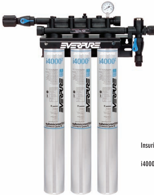
Insurice Triple-i4000 2 System: EV9325-03

Delivers premium quality water for ice applications