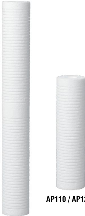
AP110 / AP124