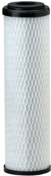
CG5-10S Replacement Cartridge: DEV9108-17