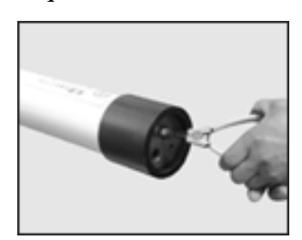
Complete End Plug

Step 5 Remove the End Plug – A threaded 1/4" pipe nipple is recommended for use when opening the end plug. Thread the pipe nipple into the Feed/Concert port of the end plug, gently motion the nipple in various directions, and then gently pull the nipple from the vessel. A firm tug may be required to release the end plug o-ring seal.