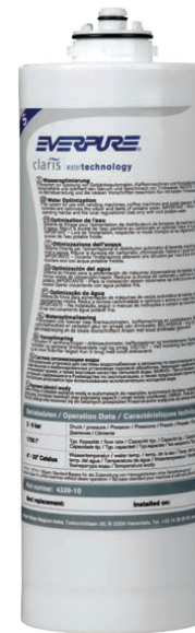
Claris Small Cartridge: EV4339-10

Everpure Claris water treatment systems (excluding replaceable elements) are covered by a limited warranty against defects in material and workmanship for a period of one year after date of purchase. Everpure replaceable elements (filter cartridges and water treatment cartridges) are covered by a limited warranty against defects in material and workmanship for a period of one year after date of purchase. See printed warranty for details. Everpure will provide a copy of the warranty upon request.