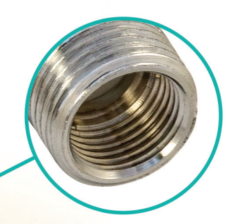
3/8" FNPT ID