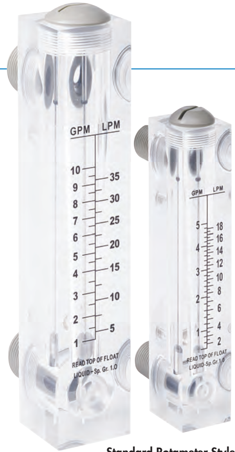
Standard Rotameter Style Flow Meters