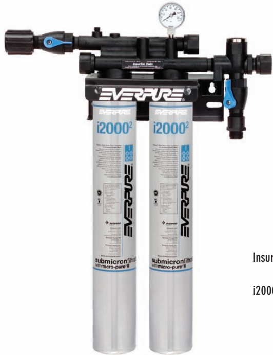
Insurice Twin-i2000 2 System: EV9324-02

Delivers premium quality water for ice applications