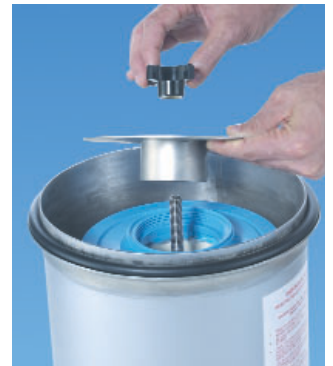
Adjustable compression cap Provides superior sealing at both cartridge ends.