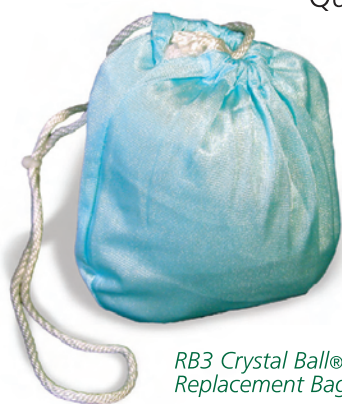
RB3 Crystal Ball® Replacement Bag

When water comes in contact with the media filaments inside the fabric pouch, the chlorine ions in the water are converted into a harmless chloride. The toxic effects of chlorine, chloramine, and chlorine gas are eliminated with the aid of KDF Formula 73, available exclusively through Rainshow'r. More chlorine is removed faster when there is adequate circulation of the Crystal Ball® in the water.