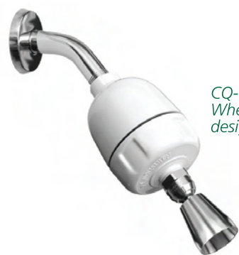
CQ-1000 with the Whedon fixed-action designer head