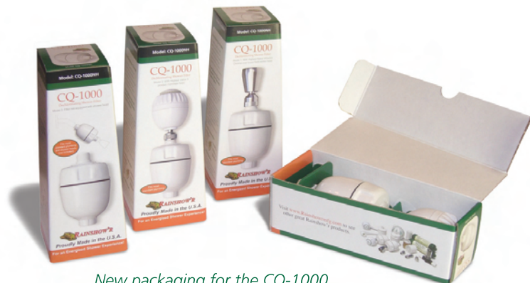
New packaging for the CQ-1000

Rainshow'r® uses a number of shower heads, Handheld kits and water control devices. These are water delivery mechanisms only. They are not performance tested or certified by NSF. Only the filter is certified.