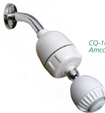
CQ-1000 with the Amcor massage head