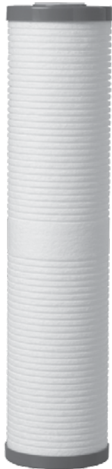
AP810-2 / AP811-2