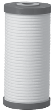
AP810 / AP811