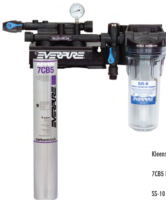
Kleensteam II Single System: EV9797-21

Everpure's second generation of total water treatment system for steam applications