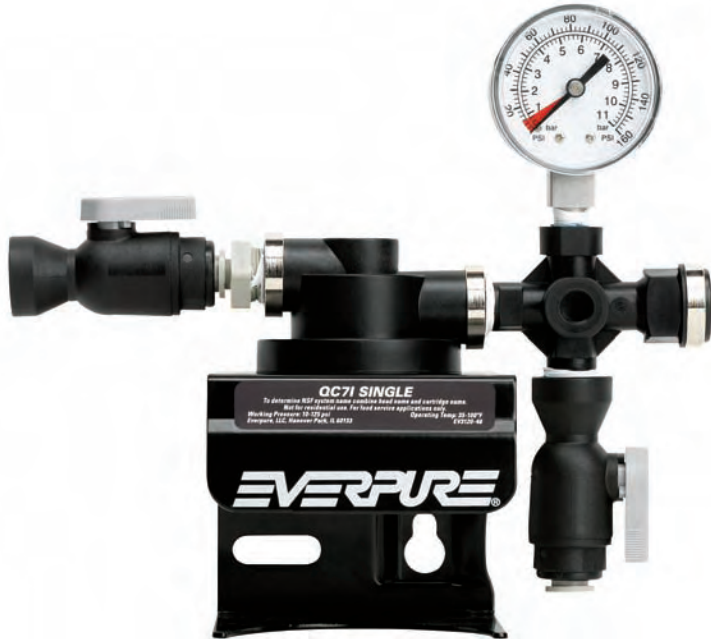
QC7I Single Head: EV9272-41

Filter head exclusively for Everpure replacement cartridges