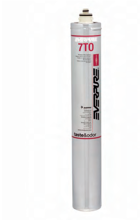
7T0 Replacement Cartridge: EV9607-05

Problem solving and special application cartridge