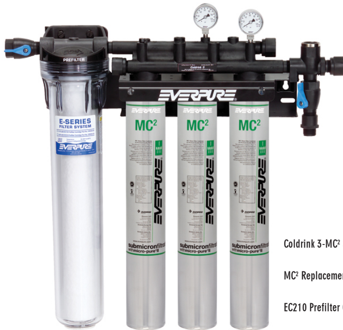
Coldrink 3-MC 2 System: EV9328-03

Delivers premium quality water for fountain applications