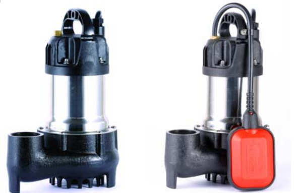
Float switch is option.