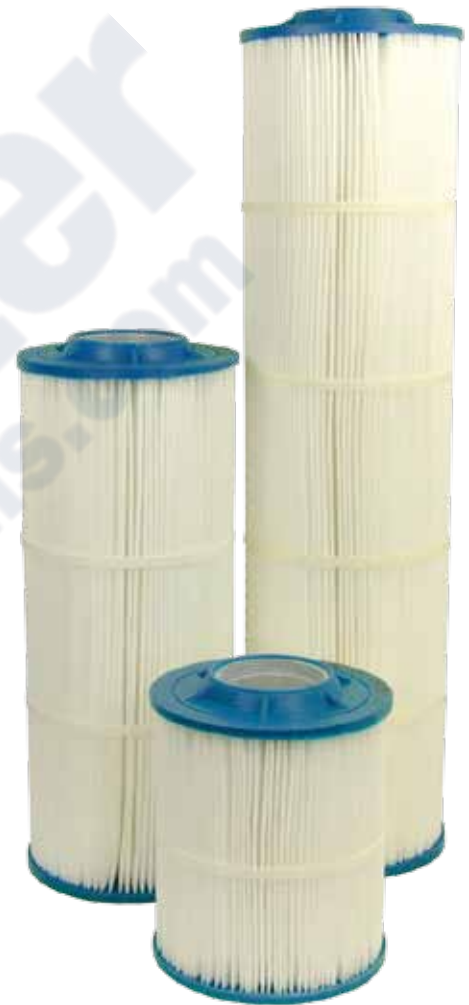
Premium Hurricane® Polyester Cartridges