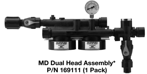
MD Dual Head Assembly* P/N 169111 (1 Pack) Replaces P/N EV927402 Designed for use with MD-CN & MD-CE filter cartridges.