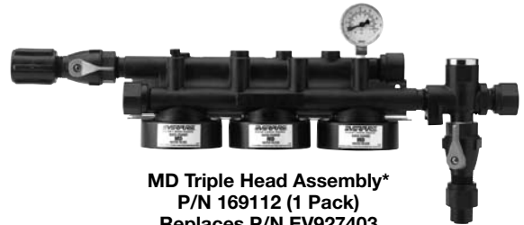
MD Triple Head Assembly* P/N 169112 (1 Pack) Replaces P/N EV927403 Designed for use with MD-CN & MD-CE filter cartridges.