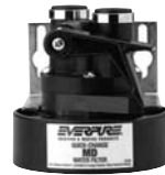
MD Single Head P/N 169110 (1 Pack) Replaces P/N EV927401 Designed for use with MD-CN & MD-CE filter cartridges.