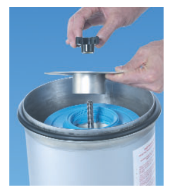
Adjustable compression cap Provides superior sealing at both cartridge ends.