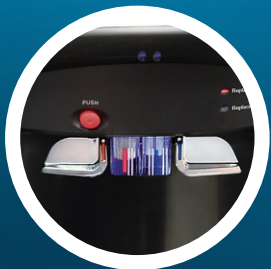
Concealed Water Outlet