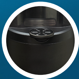
Removable Drip Tray