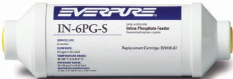
IN-6 PG-S: EV9100-67