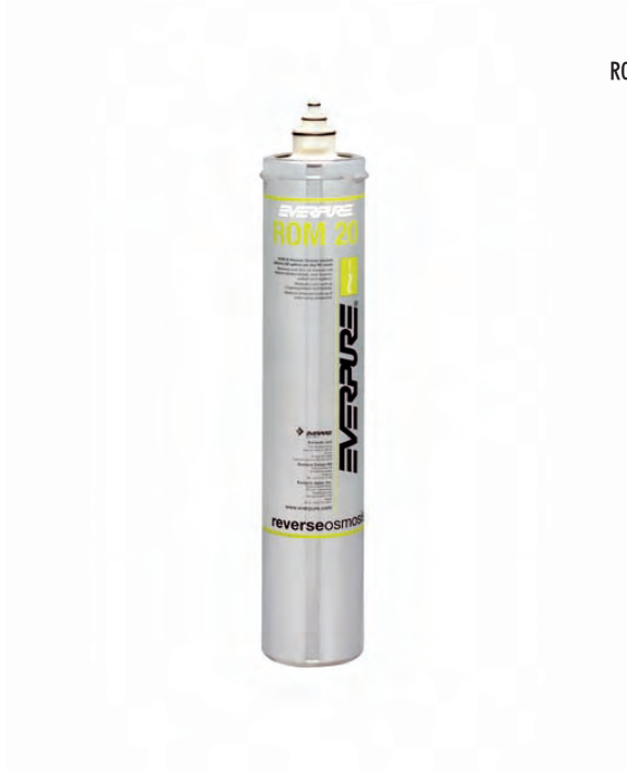
ROM 20 Replacement Cartridge: EV9273-93

Delivers premium quality water for office and vending applications