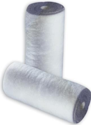
figure 1: Aquatrex filters