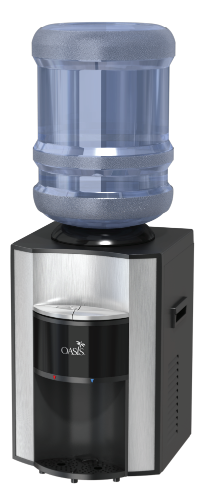
space-saving Hot 'N Cold ONYX bottle cooler fits on a countertop and is easily portable