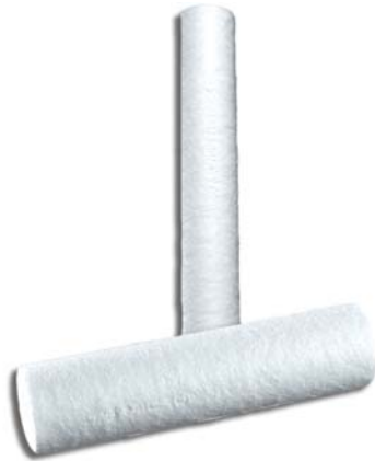
Figure 1 : Hytrex Depth Cartridge Filters