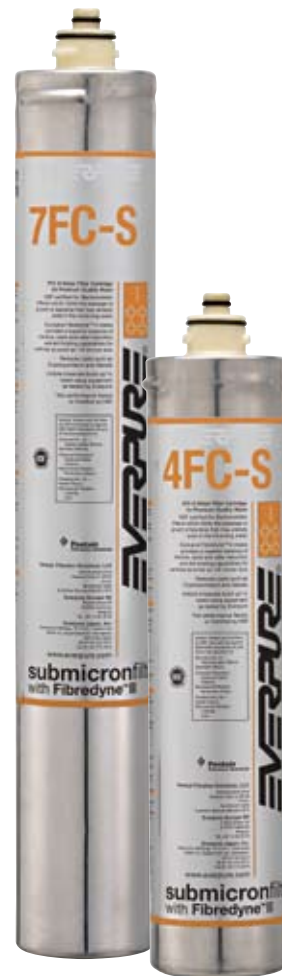
4FC-S Replacement Cartridge 1 PK: EV9692-31 7FC-S Replacement Cartridge 1 PK: EV9692-71

Always flush the filter cartridge at time of installation and cartridge change.