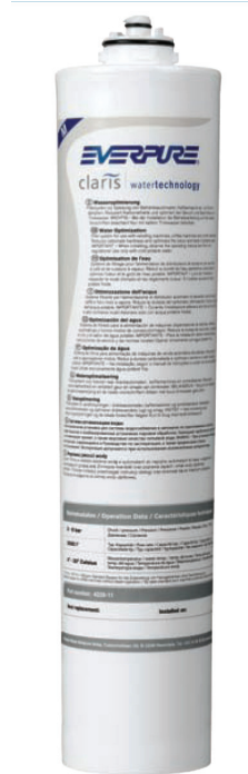
Claris Medium Filter Cartridge: EV4339-11

Everpure Claris water treatment systems (excluding replaceable elements) are covered by a limited warranty against defects in material and workmanship for a period of one year after date of purchase. Everpure replaceable elements (filter cartridges and water treatment cartridges) are covered by a limited warranty against defects in material and workmanship for a period of one year after date of purchase. See printed warranty for details. Everpure will provide a copy of the warranty upon request.