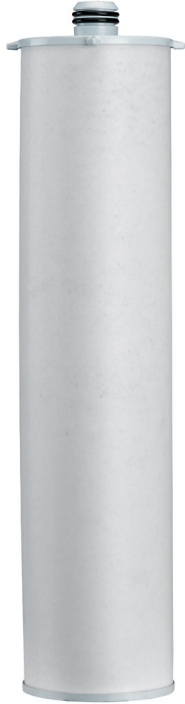
CC1E Cartridges EV9105-02

High flow, high capacity carbon filter for chlorine and chloramine reduction