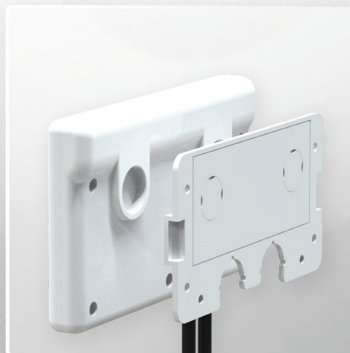
EASY MAGNETIC MOUNT