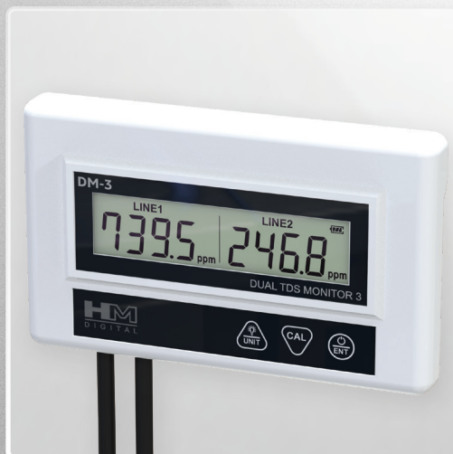
ALWAYS ON DUAL DISPLAY