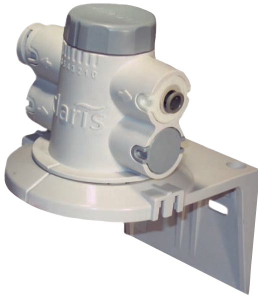
Clariss Single Head: EV4339-25

Filter head with 1/4" QC fittings exclusively for Clariss replacement cartridges