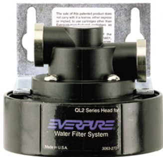
QL2 Single Head: EV9272-19 (12 pack)

Filter head exclusively for Everpure replacement cartridges