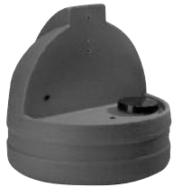
7.5-Gallon (28.4 Liters)