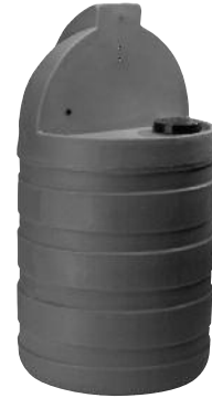
30-Gallon (113.6 Liters)