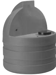
15-Gallon (56.8 Liters)