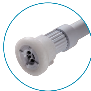
Float Switch For automatic shut-off

New quick connect port fittings allow for fast installation and replacement of suction and discharge tubing.