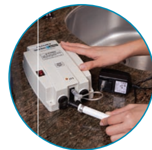
Easy to Install New quick connect port/fittings