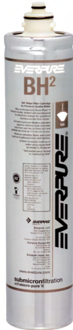
BH 2 Replacement Cartridge: EV9612-50

Delivers premium quality water for coffee applications