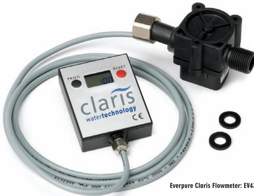
Everpure Claris Flowmeter: EV4339-31

Monitoring system for Claris filter cartridge systems