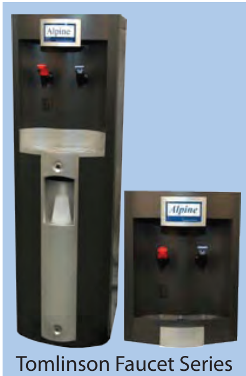
Tomlinson Faucet Series