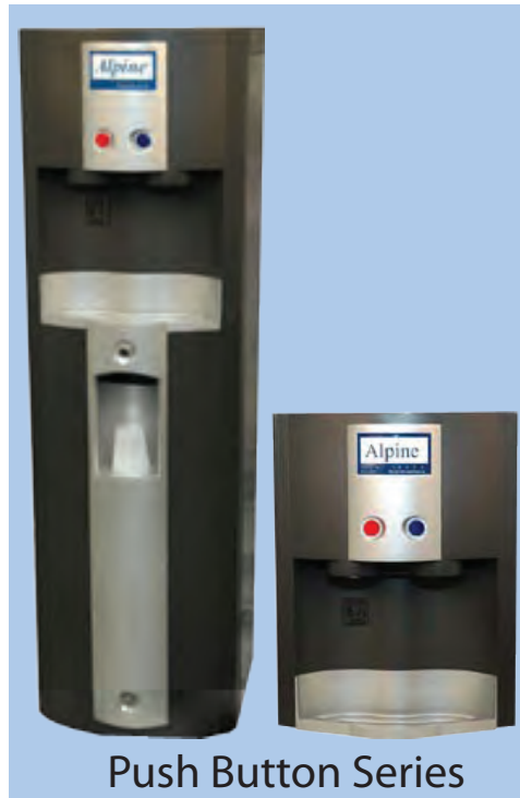
Push Button Series