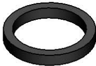
001040-45 Washer Qty = 4 ea.