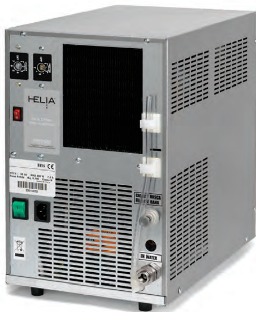
Helia Water Appliance: EV9318-50

Low Volume premium water appliance for drinking water applications