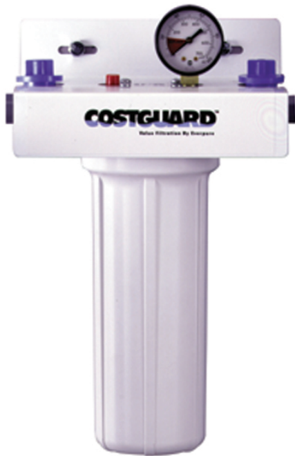
CGS-10 10" Single Housing: DEV9100-10