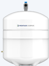
2-gallon hydropneumatic tank