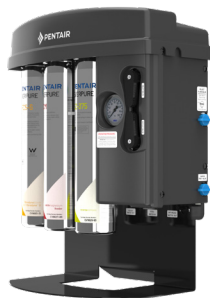
EZ-RO 375/2G with optional floor stand bracket