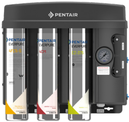
EZ-RO 375/2G wall mount