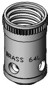
000788-20 Removable Eterna Insert, Hot Side