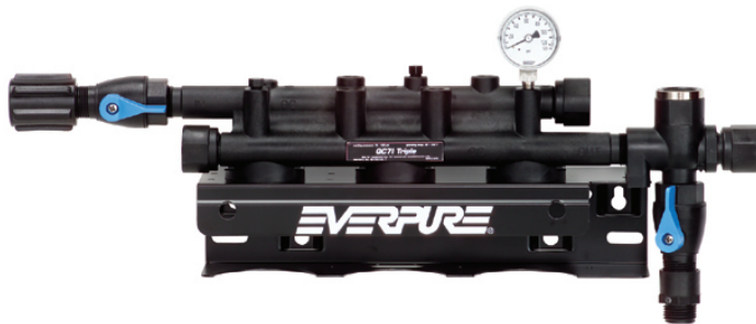
QC71 Triple Parallel Head: EV9272-23

Engineered for durability, strength and longevity. Will not corrode