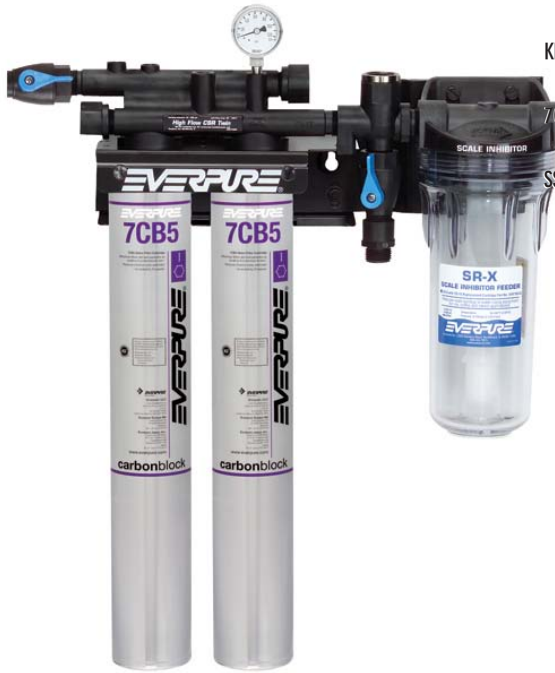
Kleensteam II Twin System: EV9797-22

Everpure's second generation of total water treatment system for steam applications