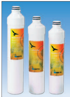
13" 11" 10"