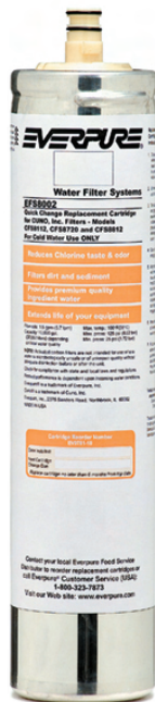
EFS8002 Replacement Cartridge: EV9781-10

Replacement filter for Cuno® Series 8000 systems