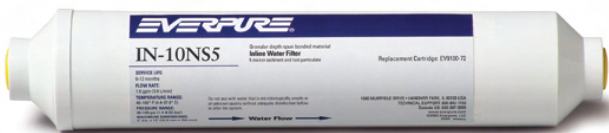
IN-10 NS5: EV9100-72