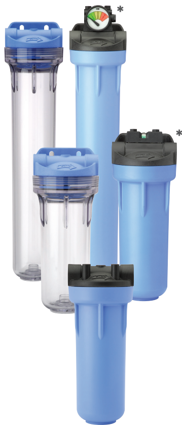
*Shown with differential gauge. Gauges sold separately.

VERSATILE DESIGN ACCEPTS MULTIPLE CARTRIDGE SIZES IN A VARIETY OF APPLICATION SETTINGS